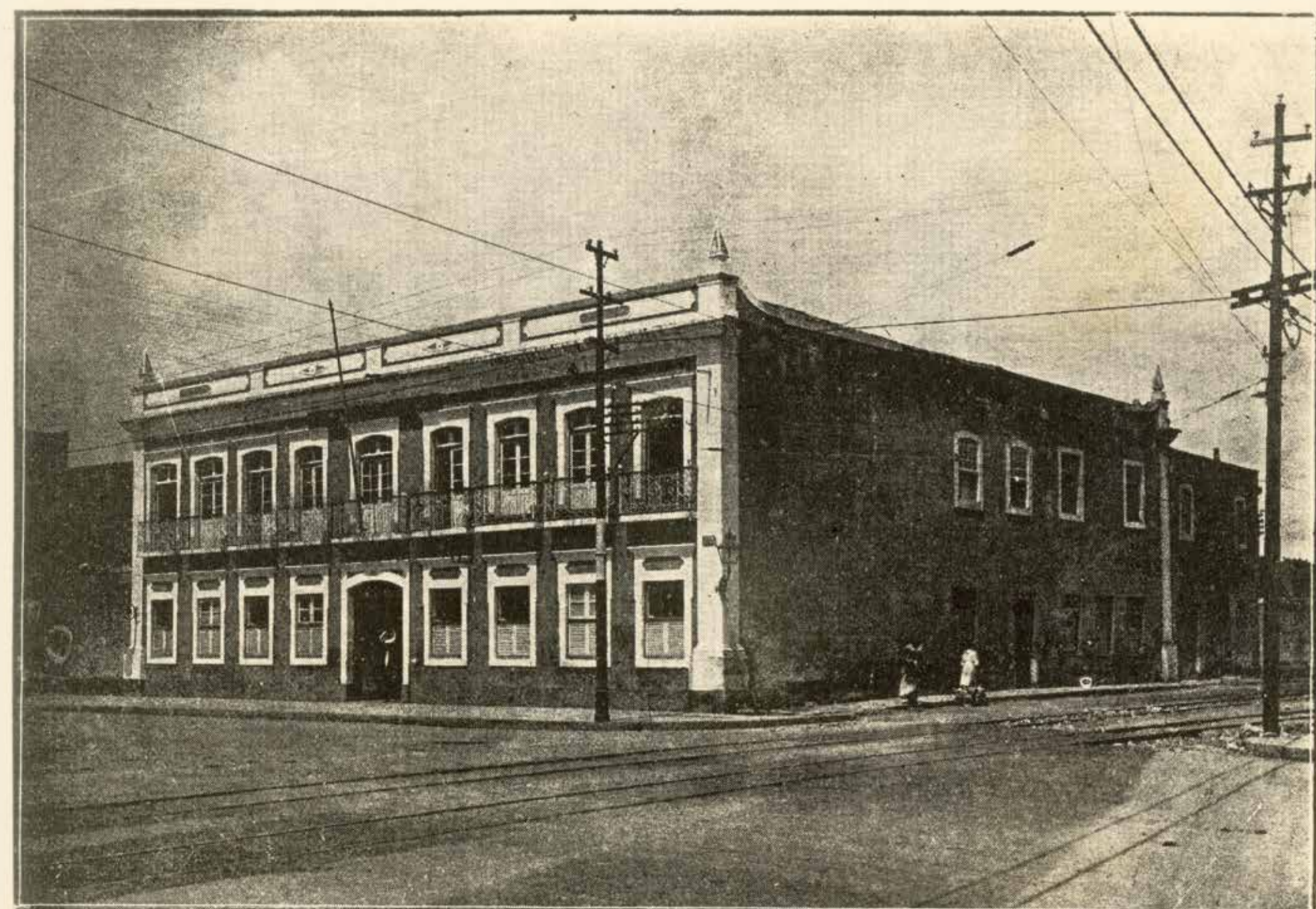
3.º edifício onde funcionou, no Recife, à rua do Hospício, a Faculdade de Direito

Rui enrolled in the College of Law in the city of Recife on March 12, 1866, at the age of 16.