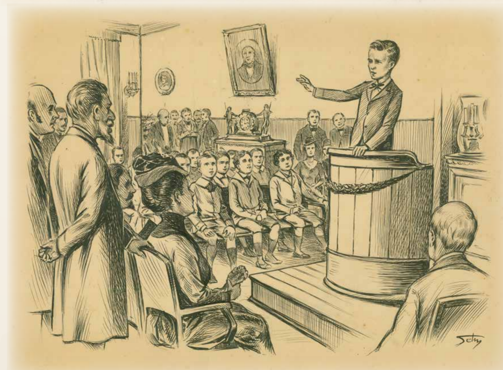
A drawing representing Rui Barbosa at the stand giving his 1st speech, with illustration from the text "No Ginásio Baiano" (At the Bahia High School)